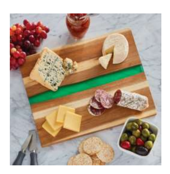
Sabatier® Resin and Wood Cutting Boards feature a resin detail that is beautiful and functional. These unique, hand-crafted boards can be used for chopping or serving.